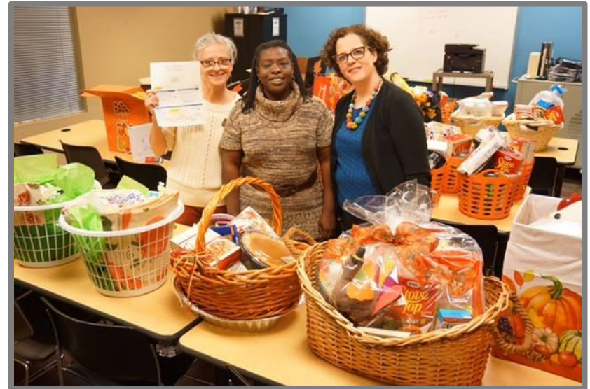
Food and Emergency Assistance